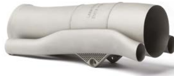
Formula 1 exhauster