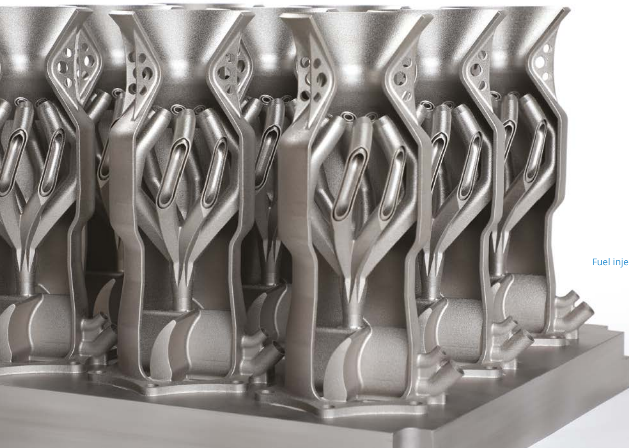
Fuel injection nozzle