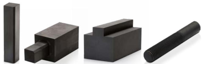
Square, staged square, T-block, and cylindrical electrodes, ready to machine and suitable for standard electrode holders.